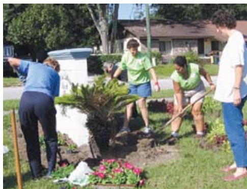
Servant activities at Orlando West Zone Rally, Apopka, Florida.