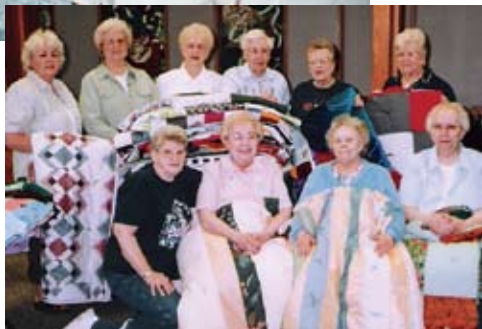
Willmar, Minnesota quilters