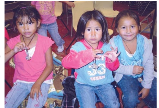
Children made cross necklaces of wire and beads wrapped around a rock to help them remember that Jesus is our ROCK!

After the convention, the cross was donated to St. Alban’s Indian