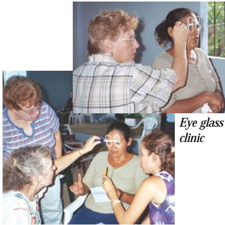
Eye glass clinic