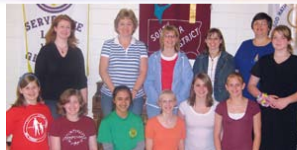
The Friends Into Serving Him group at St. John Lutheran Church, Yankton, South Dakota , enjoy making and eating s'mores and celebrate a mother-daughter tea.

A: Summer is a hard time to make good choices of how to use time — because there is so much of it to use! Invite your friend to events with your family or church youth group, or include her with your Friends Into Serving Him activities. Don't be afraid to speak up and remind her of your values and your concern for her as a friend. Remember to share God's love. In time she will most likely need you and seek your friendship.